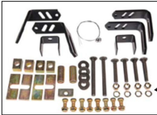
Universal Install Kit (4-Bolt 31563 pictured)

30686 UNIVERSAL BASE RAILS —The perfect rails for installing fifth wheel hitches, in a 4-Bolt or 10-Bolt application. Can be used with all Husky fifth wheel products and requires the use of a Husky install kit. Finish is durable black powdered coat. You must order either a custom bracket kit OR the 31622 10-Bolt Universal Install Kit for 10-Bolt installations, or use the 31563 4-Bolt Kit for 4-Bolt Installations.