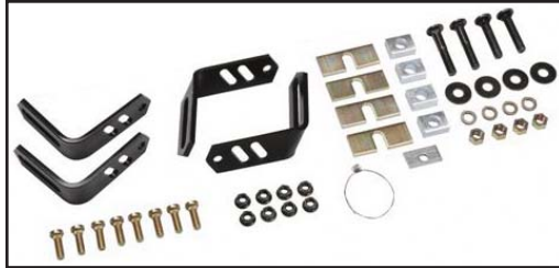
Universal Install Kit (4-Bolt 31563 pictured)

30686 UNIVERSAL BASE RAILS —The perfect rails for installing fifth wheel hitches, in a 4-Bolt or 10-Bolt application. Can be used with all Husky fifth wheel products and requires the use of a Husky install kit. Finish is durable black powdered coat. You must order either a custom bracket kit OR the 31622 10-Bolt Universal Install Kit for 10-Bolt installations, or use the 31563 4-Bolt Kit for 4-Bolt Installations.